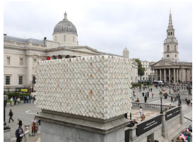
Antelope by Samson Kambalu, Fourth Plinth, 2024

From 10:20AM, the group will leave the Fourth Plinth to continue our cultural visits. A group of tutors will return to the Fourth Plinth at 11AM to pick up any latecomers. Do your best to come on time!